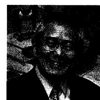
Purdue University Distinguished Professor Mr. Ei-ichi Negishi (Teijin Group Distinguished Fellow) 5th year Teijin Kumura scholarship (1957)

When you find your own "Dream", please challenge it thoroughly until the truth is investigated. I look forward to your great success in the future.